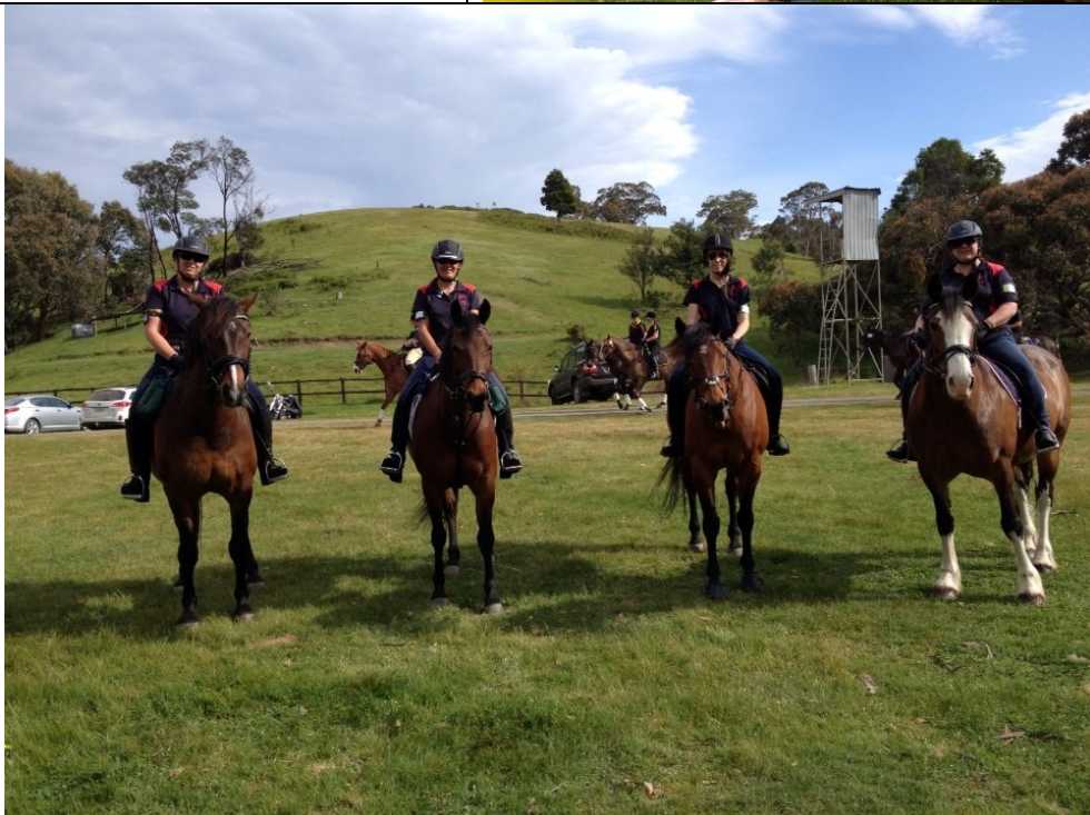
Below : Ready to head off