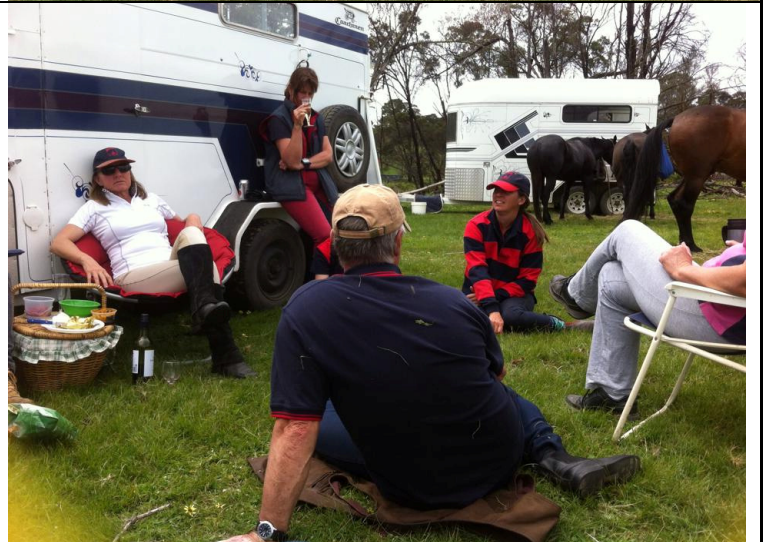
Right : relaxing with some bubbles